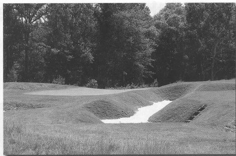
#1 – The ninth at Myopia